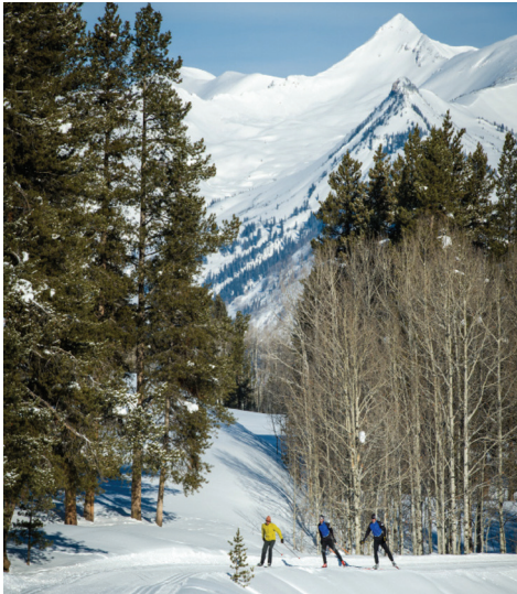
Slate River Valley, Crested Butte Nordic