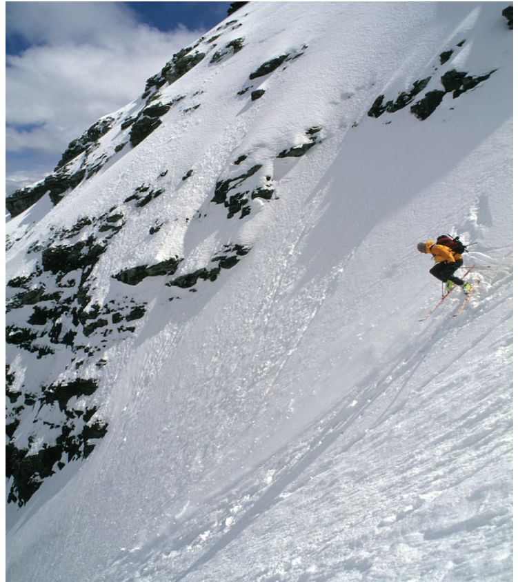
Erickson Creative Group

We had expected to see a final rule by September 9, 2014 but the Forest Service filed a motion to extend this Court-ordered