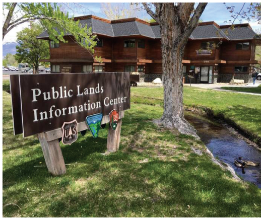
ESIA operates 11 bookstores and visitors centers in cooperation with public land management agencies on the Inyo, Tahoe, and Humboldt-Toiyabe National Forests

ESIA was also a primary partner in establishing the first-ever Eastern Sierra SnowSchool program, providing exposure for over 100 Mammoth Elementary School fifth graders to an outdoor educashed and climate dynamics, and winter ecology.