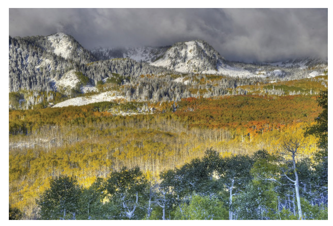
Bonanza Flats, courtesy Utah Open Lands Photo by G. Brad Lewis